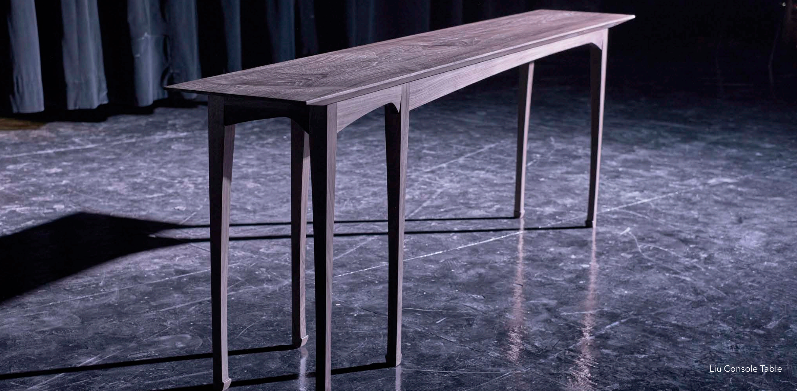
Liu Console Table